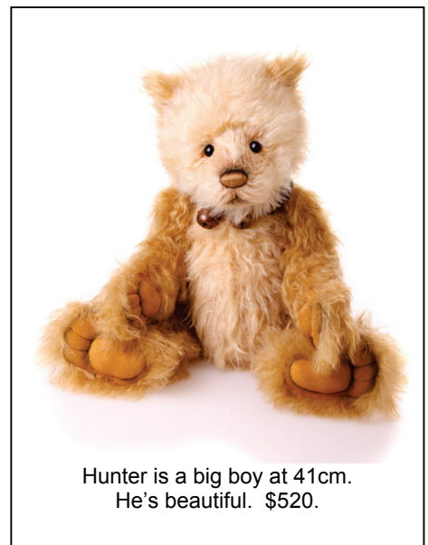
Hunter is a big boy at 41cm. He's beautiful. $520.

Price: $520. He should be here by the time you receive this newsletter. Limited quantity – be quick!