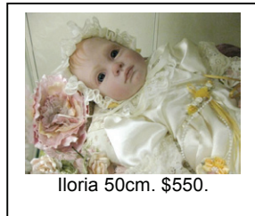
Iloria 50cm. $550.