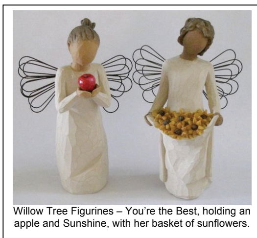
Willow Tree Figurines – You're the Best, holding an apple and Sunshine, with her basket of sunflowers.

New for 2011 and now in stock are 'You're the best! Angel', 'Sunshine Angel', $30 each. The Quilt Figurine, Welcome Home Figurine, Home Figurine $50 each.