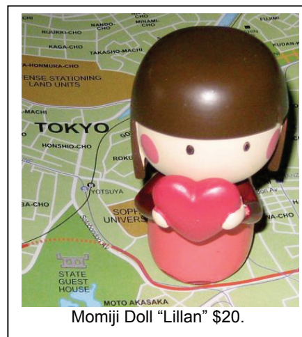
Momiji Doll "Lilian" $20.